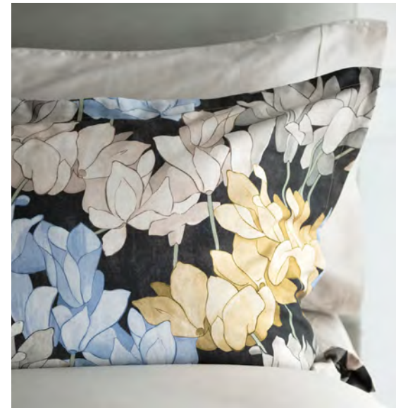
Della styled with Capri Platinum, Capri Bluebell, and Alfie Citron.