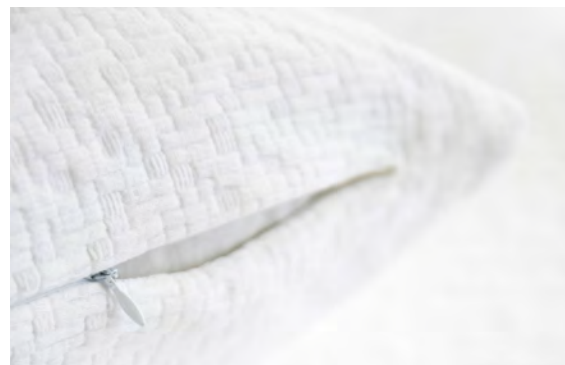
Rochelle styled with Capri White and Isla Grove.