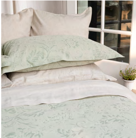
Willow Pistachio styled with Nicola Linen and Avalon.