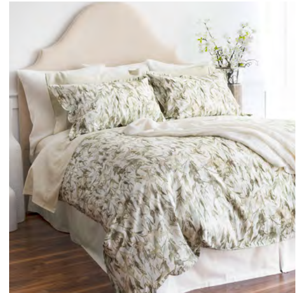
Prado styled with Capri Lime Rickey and Avalon.