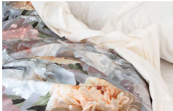
Bijoux styled with Venice Cream.