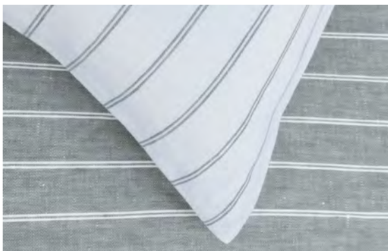
Linea Shale / Chalk styled with Nicola Optical White.