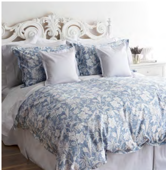
Isla Grove styled with Capri Birch and Rochelle.