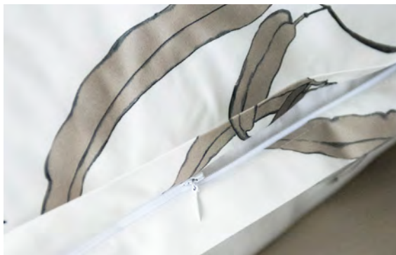
Cordao styled with Capri Putty.