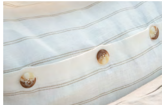
Linea Latte / Pannacotta styled with Nicola Linen and Avalon.