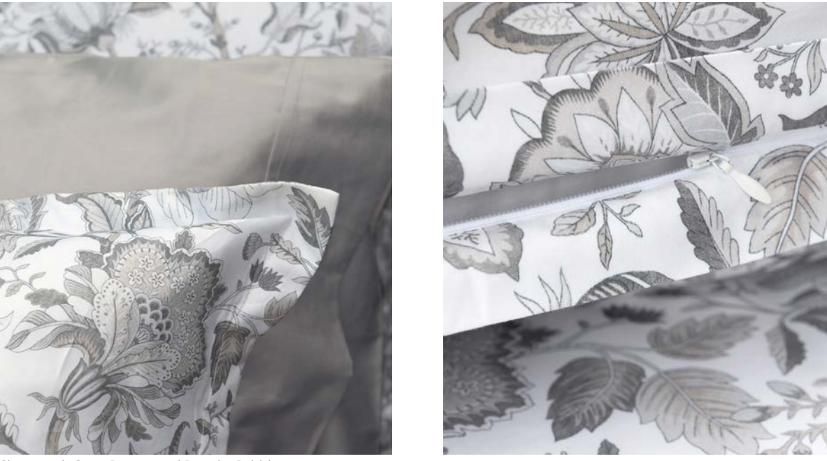
Shown with Capri Pumice and Biancha Pebble.

Immerse yourself in the timeless beauty of Inesa, a botanical print that pays homage to classic block prints. With its decorative leaves and florals, this design brings a touch of classical whimsy to your bedroom. Embrace an endless summer with Inesa's captivating charm and infuse your space with nature's grace, combining its captivating monochrome with countless colours to match your mood.