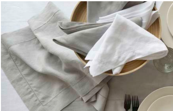
Top: Echo Plum and Echo Lemongrass, classic hem. Above: Echo Mist and Echo Paper, hemstitch.