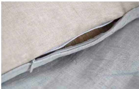
Fortuna styled with Veritae, Avalon, Forma Ochre, and Forte Natural.