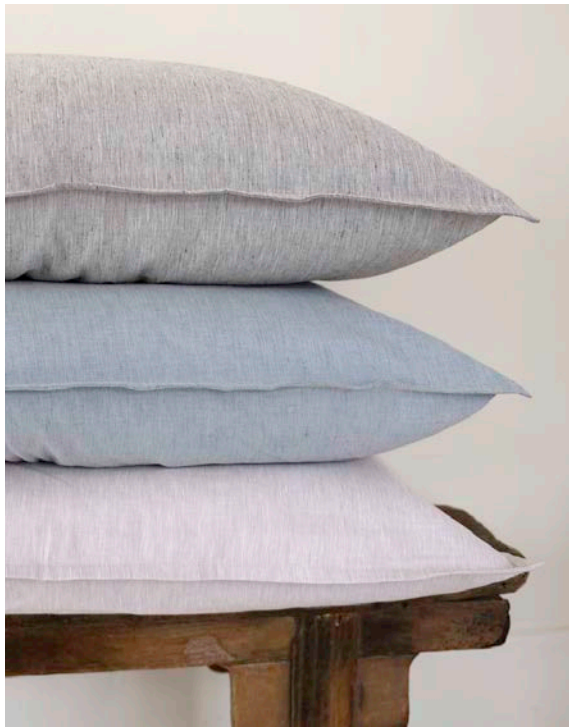
Above (top to bottom): Riva Carbon, Denim and Blush. Left: Riva Poppy styled with Echo Rhubarb and Forma Indigo.