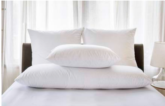
Body pillow, queen pillow and grand euros.