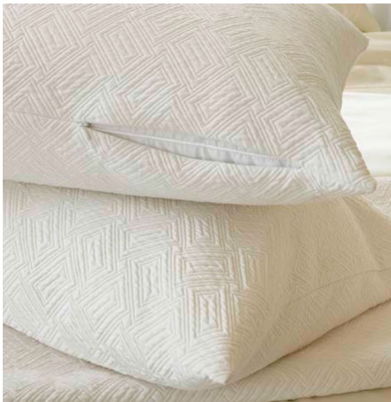
Scala Cream styled with Regency Cream.