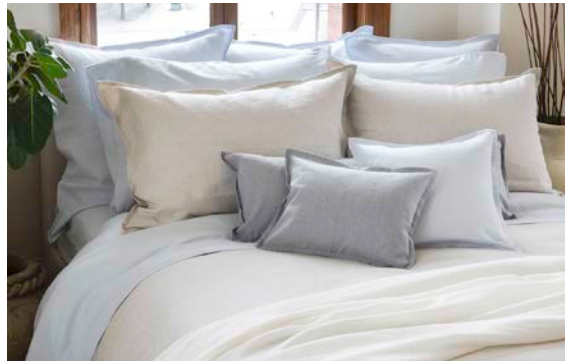
Top: Echo Sky. Above: Echo Linen styled with Echo Sky, Riva Denim and Avalon.

Paper, Vanilla, Linen, Lemongrass, Eucalyptus, Atlantic, Sky, Admiral, Marina, Plum, Petal, Rhubarb, Copper, Mist, Shale