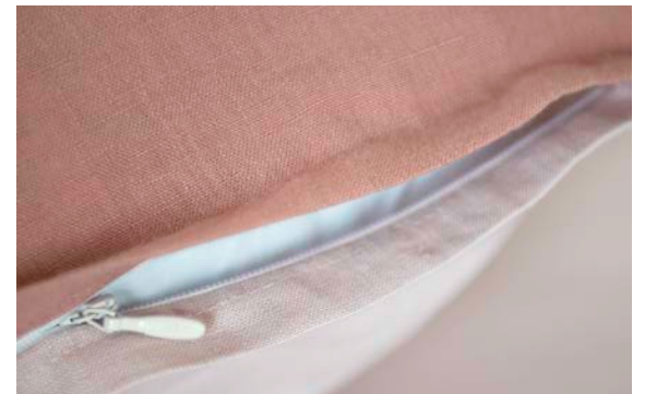
Echo Duo Petal and Rhubarb.

Select two colours from the 15 colourways to create your Echo Duo.