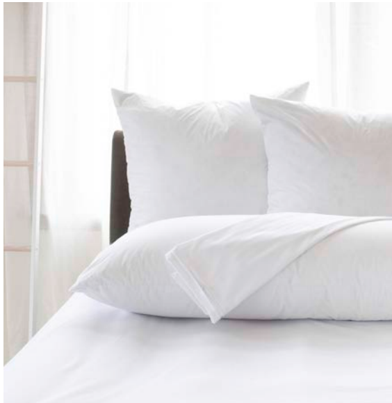
Above: Body pillow, euros and Luxury body pillow protector. Right: Athena Blanca styled with Bianca Pebble and Forte Grey.