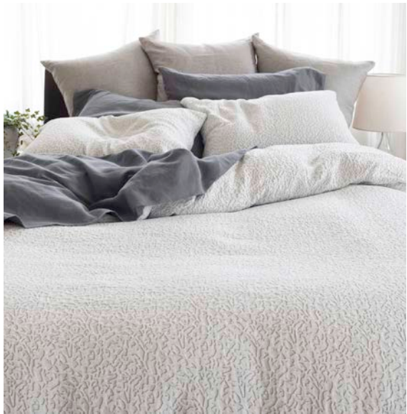
Above: Athena Sterling styled with Echo Shale and Forte Grey Left: Athena Parchment styled with Venice Rose and Avalon.