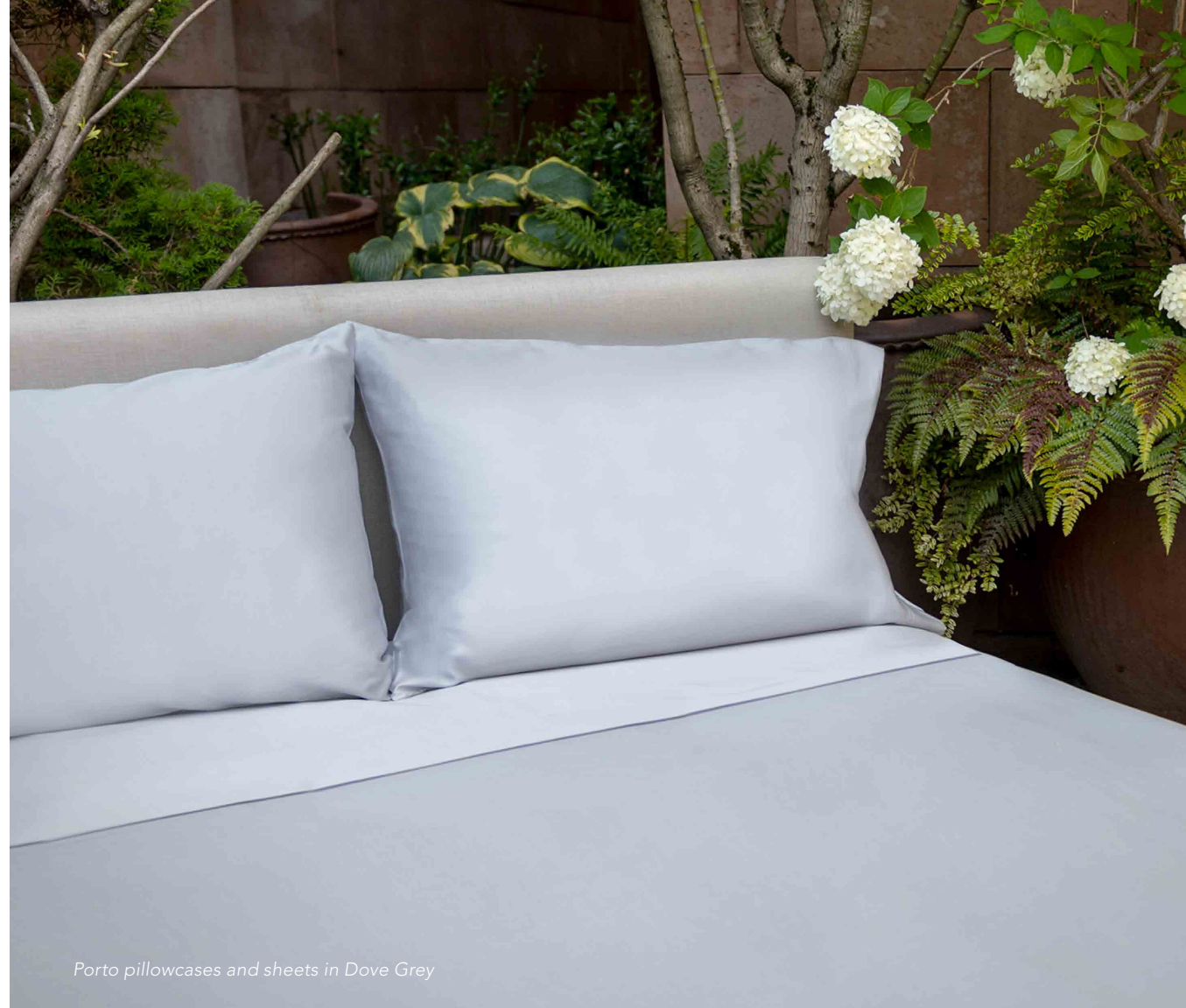
Porto pillowcases and sheets in Dove Grey