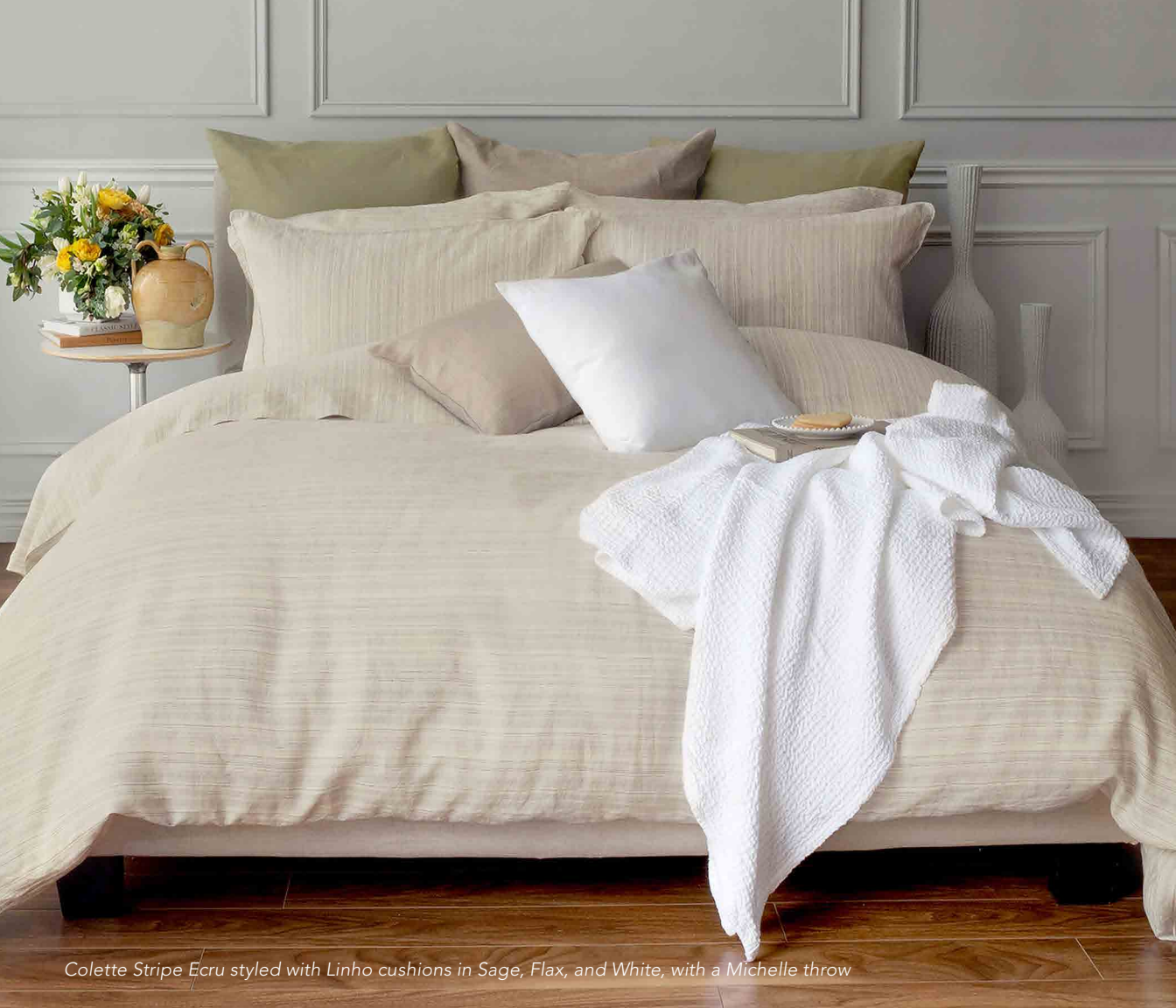
Colette Stripe Ecrú styled with Linho cushions in Sage, Flax, and White, with a Michelle throw