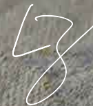
Lossen Zimmerman Creative Director

Let's create spaces where the everyday moments of our lives become extraordinary—like retreating to the bedroom after a busy day and folding back the sheets, to waking up feeling refreshed after a good night's sleep and taking pleasure in a freshly made bed.