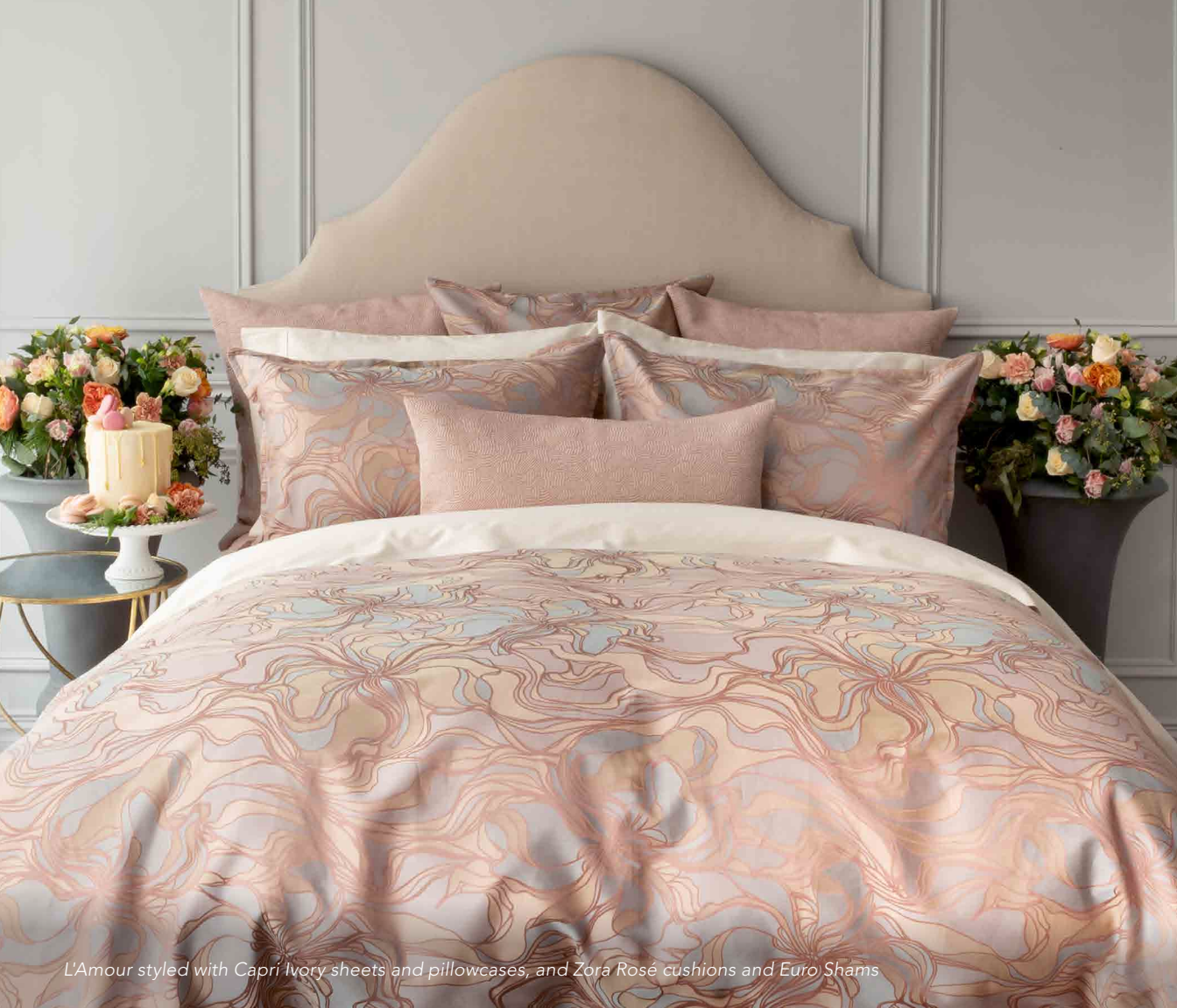
L'Amour styled with Capri Ivory sheets and pillowcases, and Zora Rosé cushions and Euro Shams