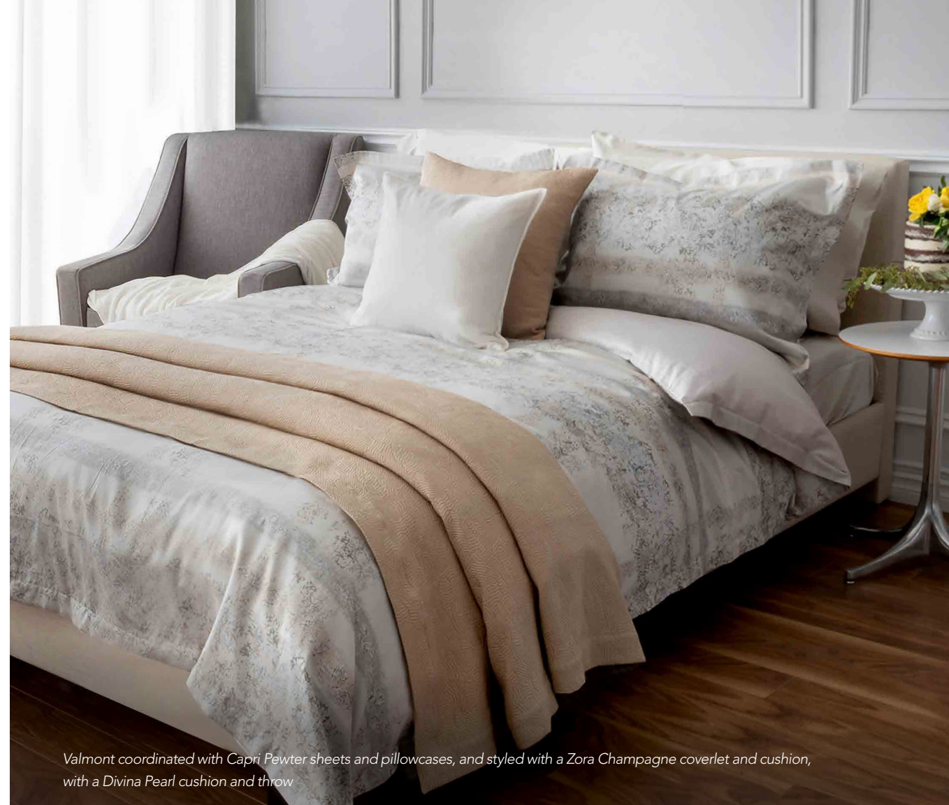
Valmont coordinated with Capri Pewter sheets and pillowcases, and styled with a Zora Champagne coverlet and cushion, with a Divina Pearl cushion and throw