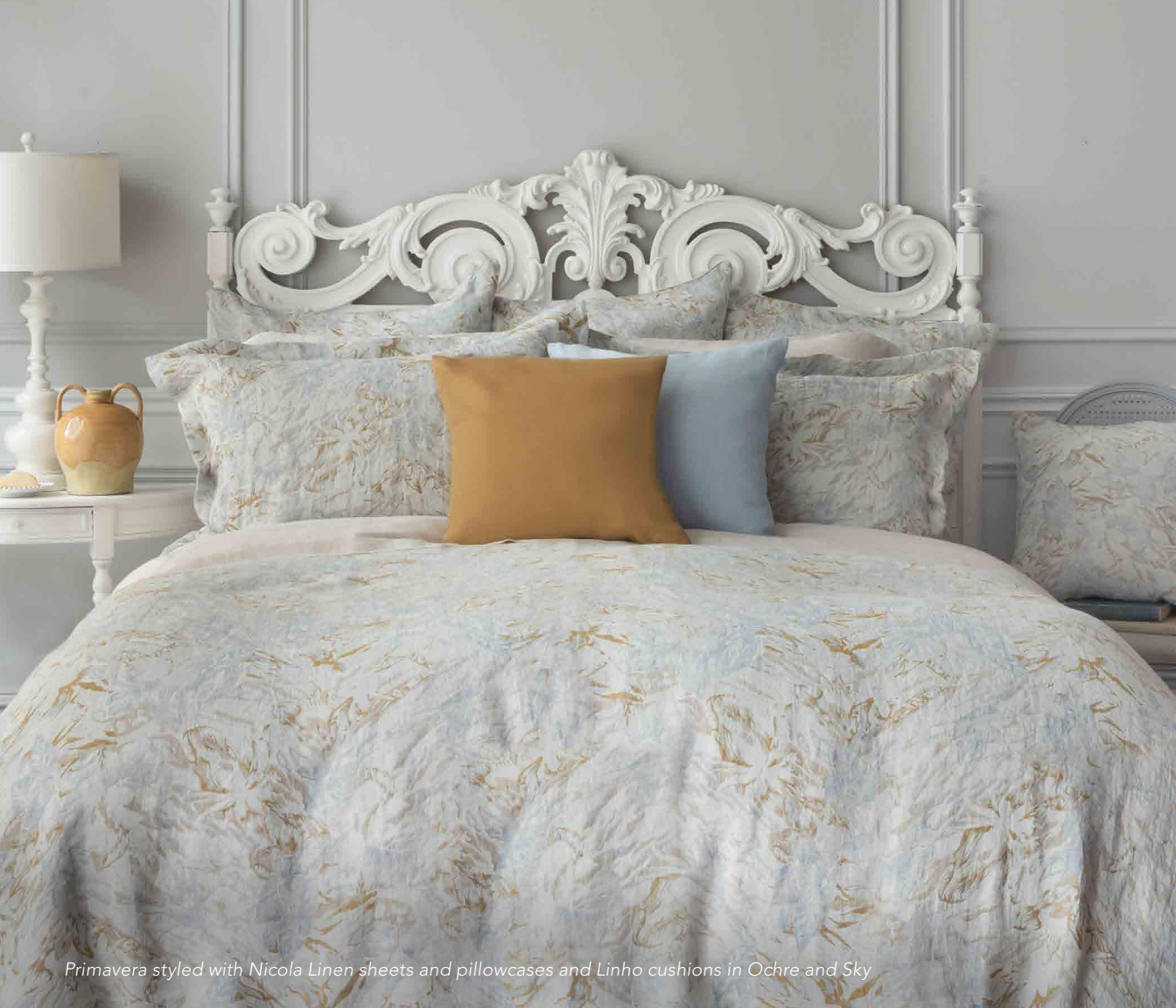
Primavera styled with Nicola Linen sheets and pillowcases and Linho cushions in Ochre and Sky