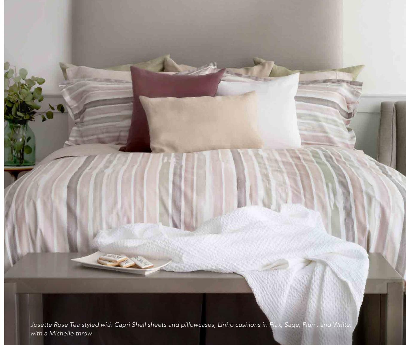
Josette Rose Tea styled with Capri Shell sheets and pillowcases, Linho cushions in Flax, Sage, Plum, and White, with a Michelle throw