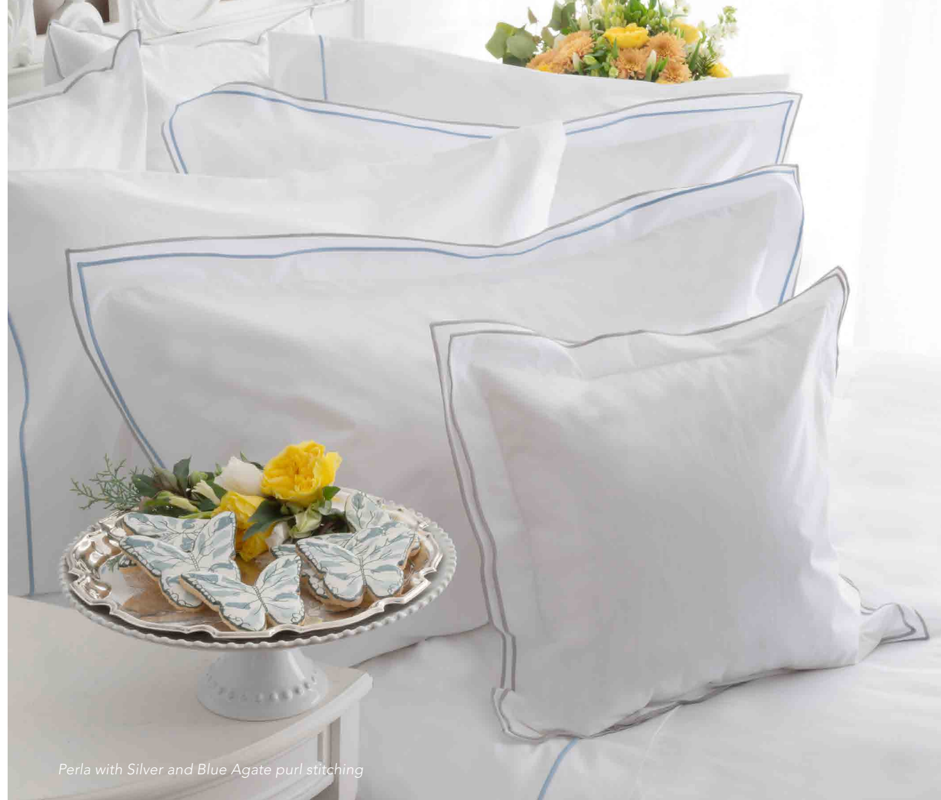
Perla with Silver and Blue Agate purl stitching

2" double open flange with purl stitching detail and overlap back