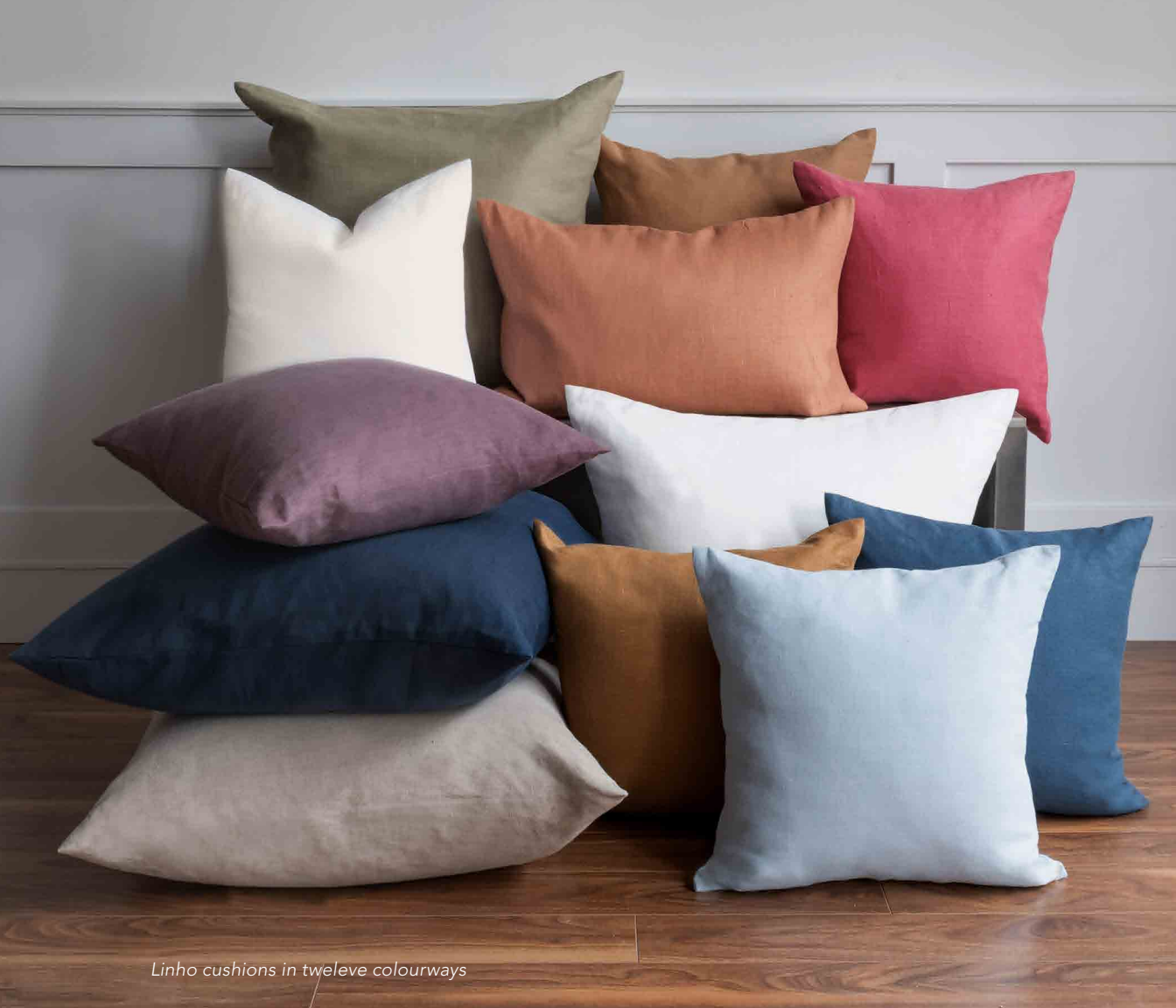
Linho cushions in twelve colourways