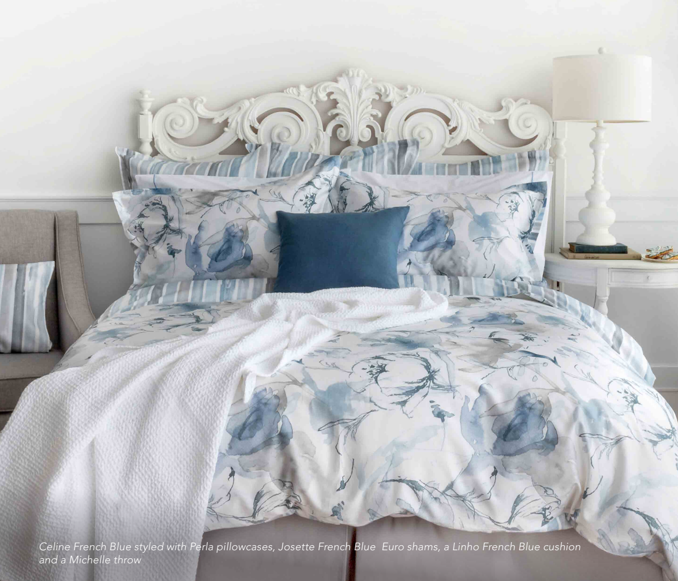
Celine French Blue styled with Perla pillowcases, Josette French Blue Euro shams, a Linho French Blue cushion and a Michelle throw