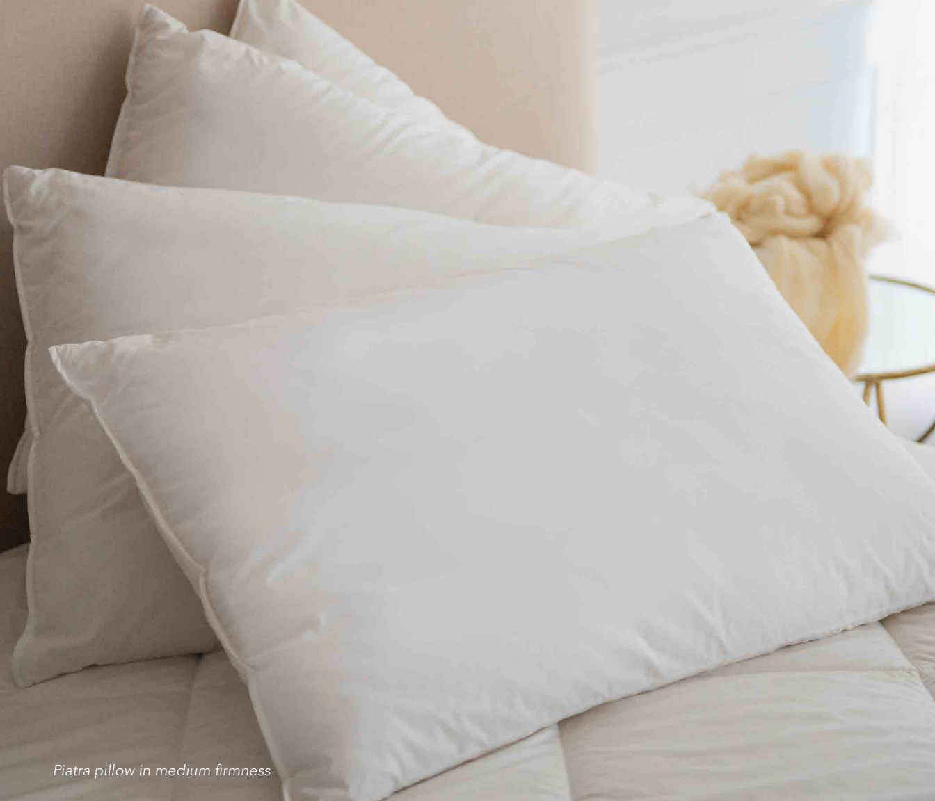
Piatra pillow in medium firmness