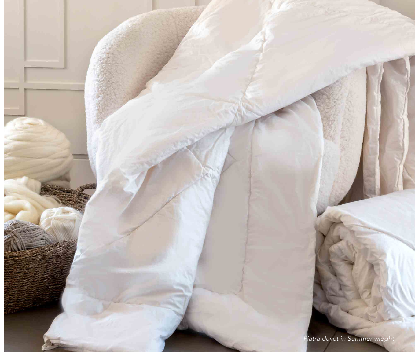
Piatra duvet in Summer weight